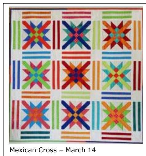
Mexican Cross – March 14

On Friday March 14 she will teach Mexican Cross. This is a great pattern for using up those favorite fabrics you have been waiting to use. It also lends itself to a scrap quilt.