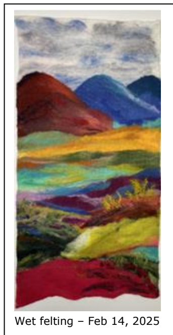
Wet felting – Feb 14, 2025