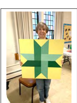
For More photos, check out the Guild Facebook page