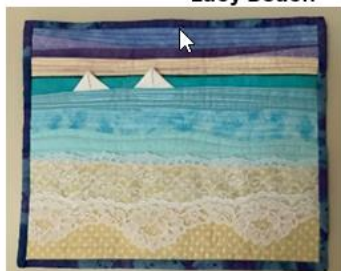
Friday October 11, 2024 9am-3pm Lacey Beach