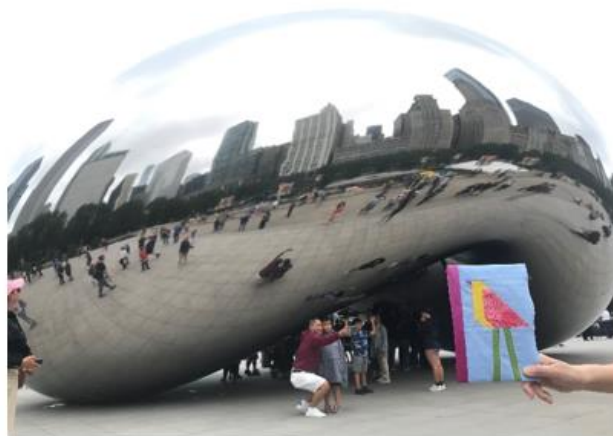
The Bean, Chicago